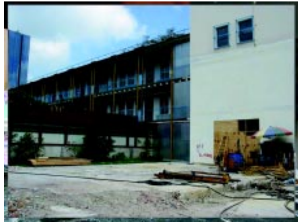
Construction progress photos taken on 9 th September 2003.