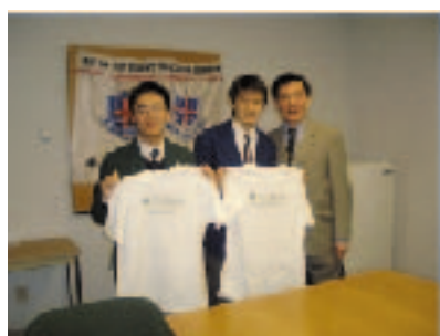
22 March 2005 Edmonton