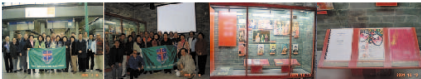
Section on Wah Yan Drama Society