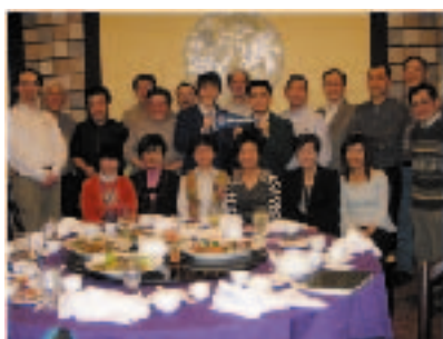
26 March 2005 Calgary